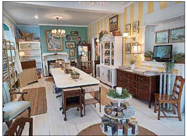
Shown is the shopping area in the building, with items in display cases, which are for sale.