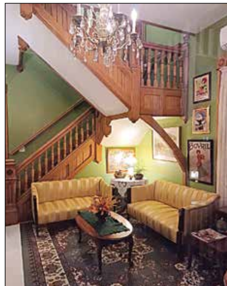
The building is a Queen Anne Victorian, decorated to accentuate the charm and authenticity of the building’s architecture.