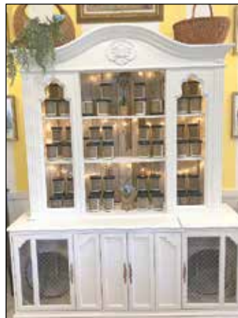
For sale are 100% soy candles made in the USA.