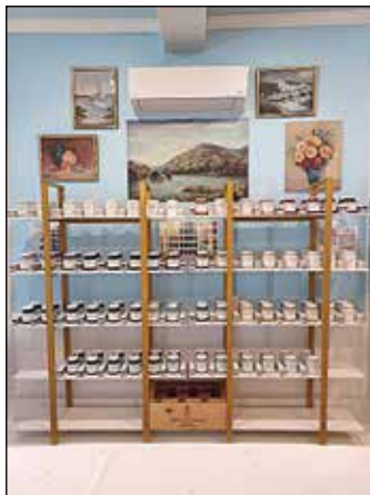
The Victorian carries Fusion Mineral Paint for furniture re-purposing and re-finishing.